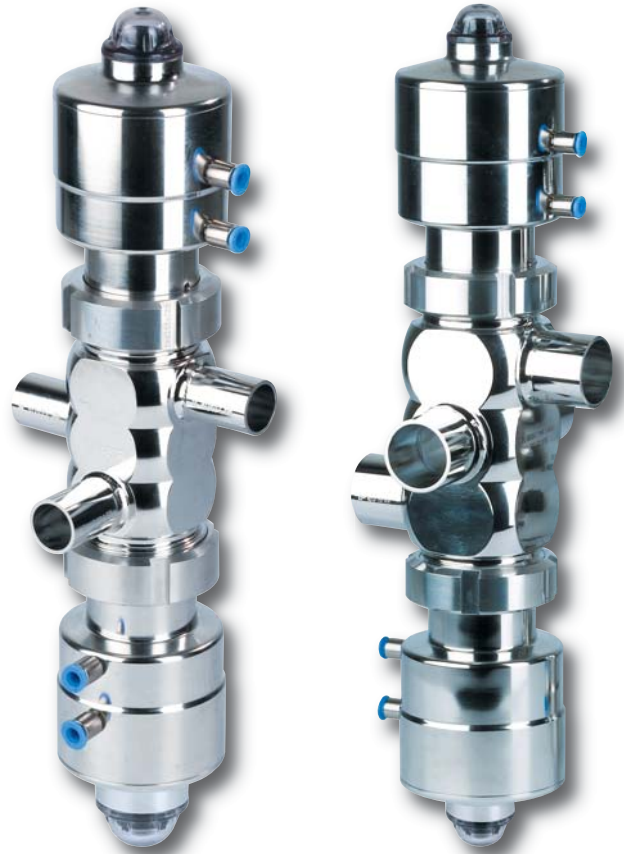
VESTA® type HWA valve block with 3 connections